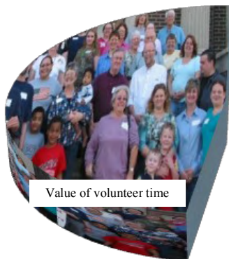
Value of volunteer time

THE VALUE OF VOLUNTEER TIME IS NEARLY EQUAL TO ALL OTHER RESOURCES COMBINED